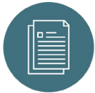
Estate &amp; Trust Solutions